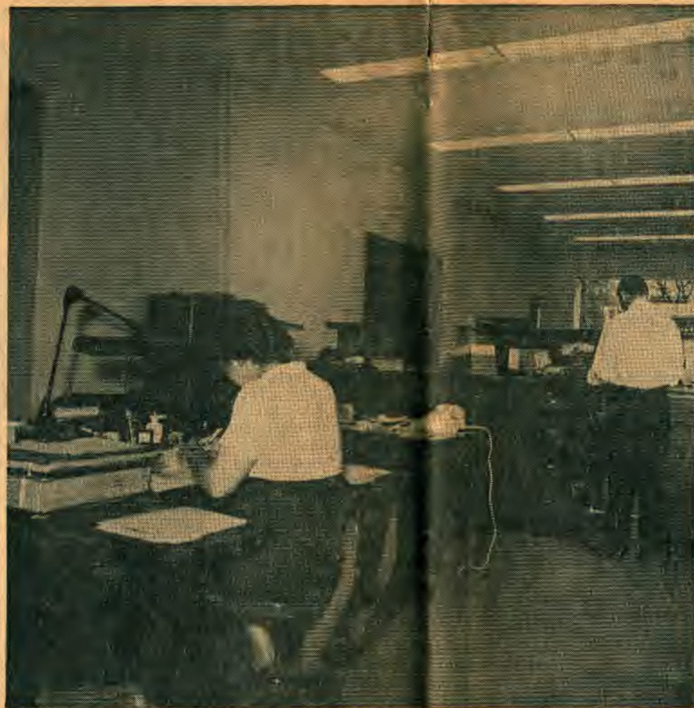
LOAN TRANSACTIONS, too, are handled expertly, fast, and in friendly manner in the atmosphere of the clean, light surroundings. The Wheeling State bank, currently revamping the loan department, will announce new policies at a later date.