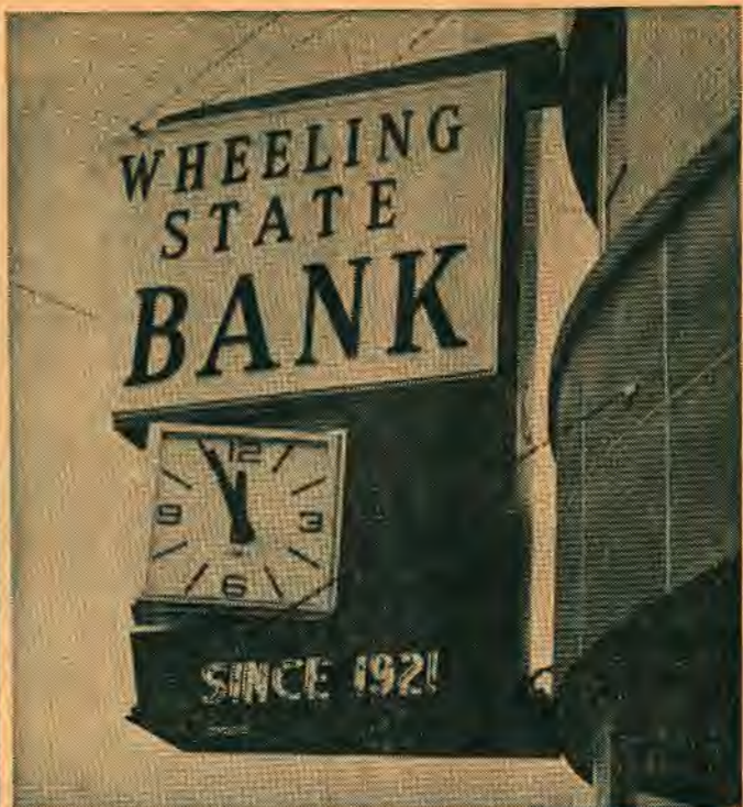
ROTATING BEACON , the new landmark of the bank catches the eye of motorists on the arterial intersection of Milwaukee ave. and Dundee rd. Installed last month, the sign is already a meeting place as "Meet you under the clock" becomes a popular phrase.

We offer our most sincere congratulations to the Wheeling State Bank