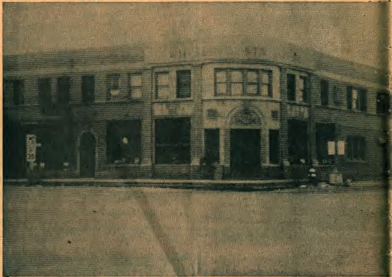
The Old Bank Building . . .