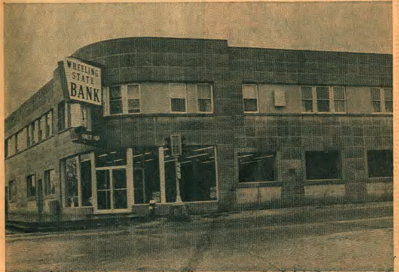
. . . And the New Wheeling State Bank