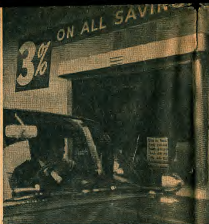
DRIVE-IN WINDOW of Wheeling State bank is recent innovation that speeds deposits and withdrawals — its popularity is sweeping the country. The Wheeling bank was the first in the area to install this new procedure.